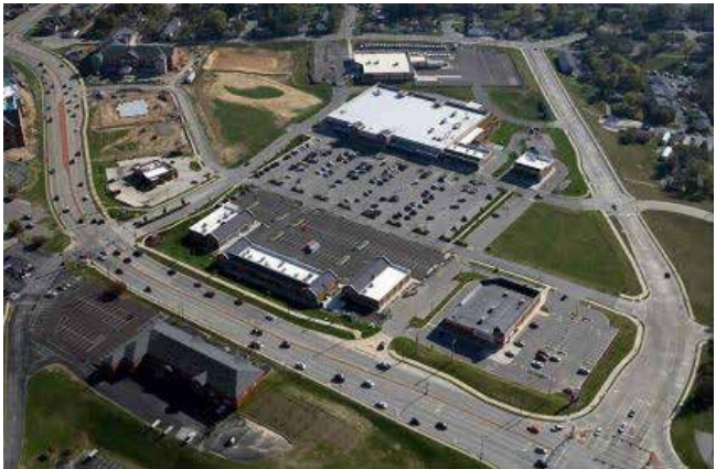
University Commons Mixed use development, located directly across from Lindenwood University. Anchored by Schnucks grocery store. www.DescoGroup.com