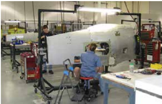
Defense & Aerospace