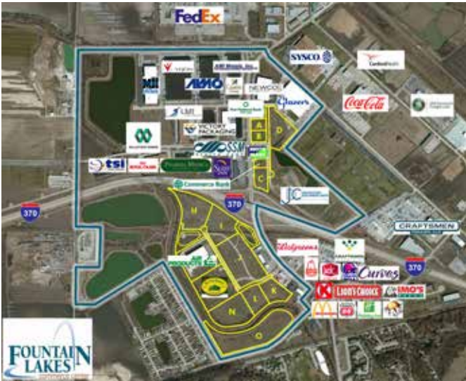
Fountain Lakes Commerce Center Industrial and Commercial zoning. Sites for Sale or Build-to-Suit from 1.58 to 29 Acres. www.Lee-Associates.com