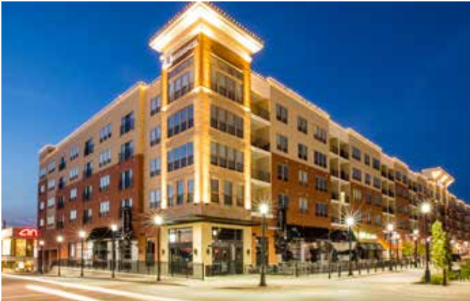
The Streets of St. Charles Mixed use development, located near Ameristar, St. Charles Family Arena, St. Charles Convention Center and Historic Main Street. www.TheStreetsofStCharles.com

If It's Happening...It's Happening in St. Charles!