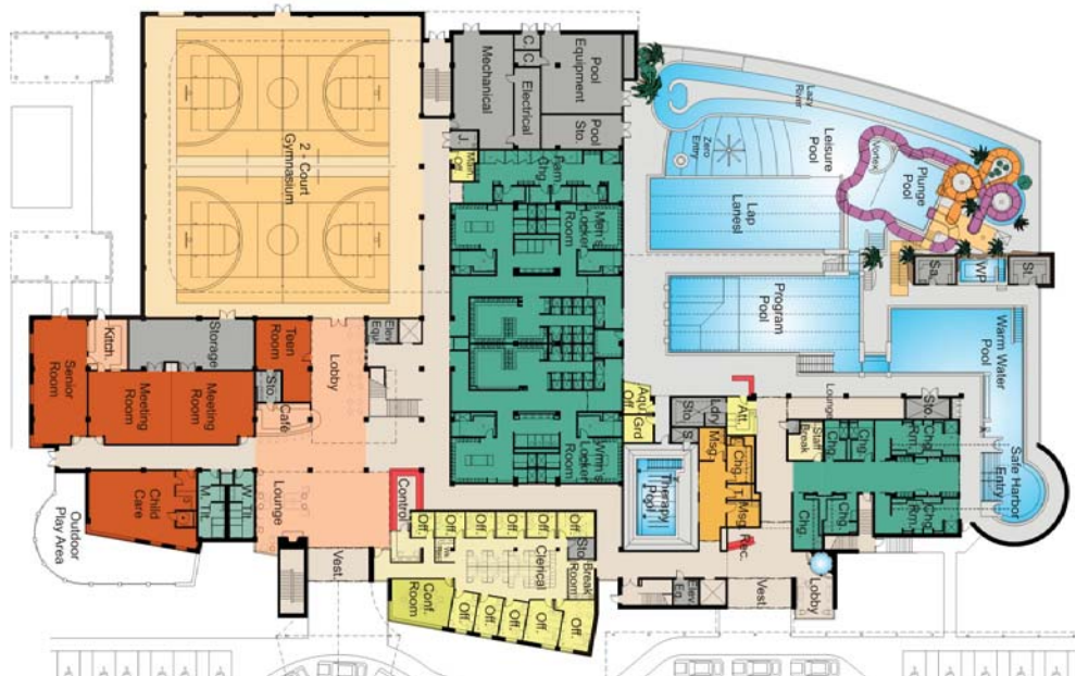
Community Freedom Center

The City of St. Charles will ask voters on August 5 to approve a bond issue – Proposition C – that would authorize up to $30 million in General Obligation Bonds. The bond issue would not impose any new tax on residents.