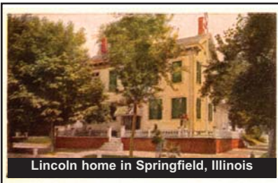
Lincoln home in Springfield, Illinois